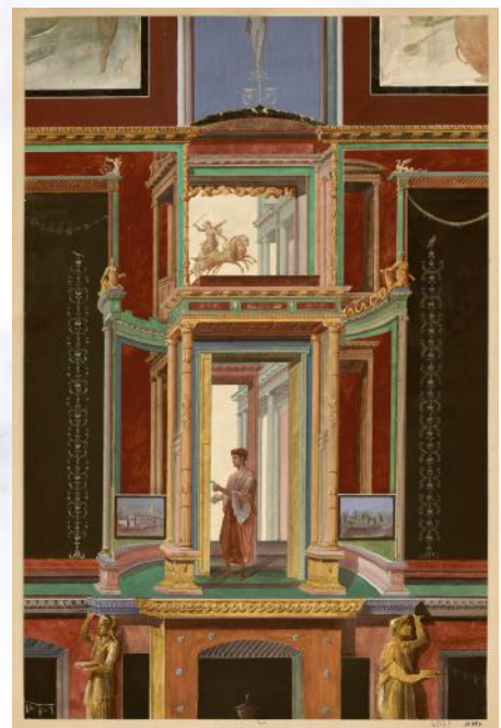
Pompei (Italy), Relief of a Pompeian painting, Charles Garnier