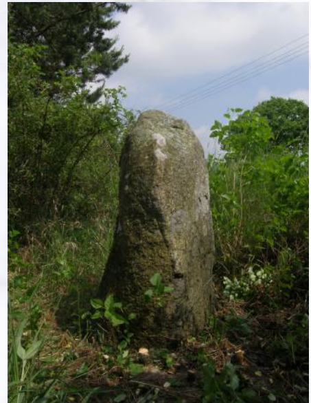
Skuodo (Lithuania), The Krakly stone Stabakūlis, Aruodai