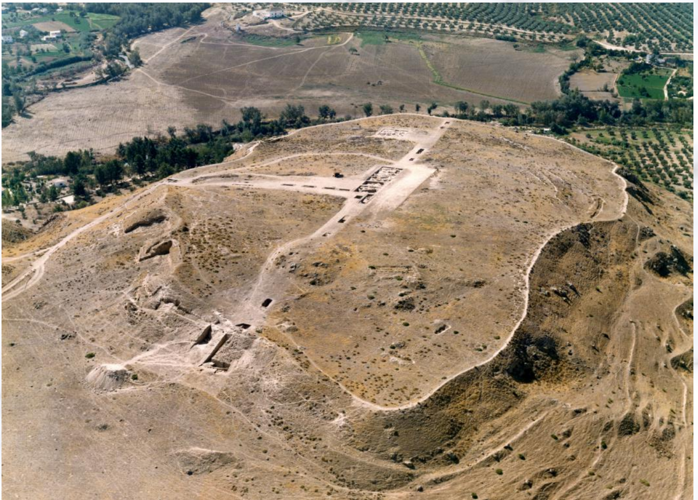
Jaen (Spain), Iberian oppidum of Puente Tablas, Instituto de Arqueología Ibérica-Universidad de Jaén

Europeana Archaeology (February 2019 - July 2020) is a Project funded by the European Commission within the Programme Connecting Europe Facility: Telecom.