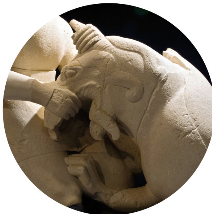
Griphomaquia. Sculptural group from Cerrillo Blanco (Porcuna, Jaén, España), Instituto de Arqueología Ibérica-Universidad de Jaén, CC BY-NC