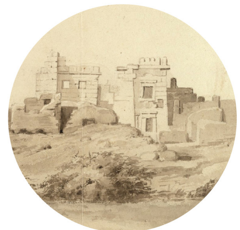
Medinet Habu