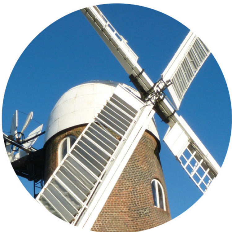
Wilton Windmill

Europe's rich heritage of archaeological monuments, historic buildings, cultural landscape and artefacts in Europeana