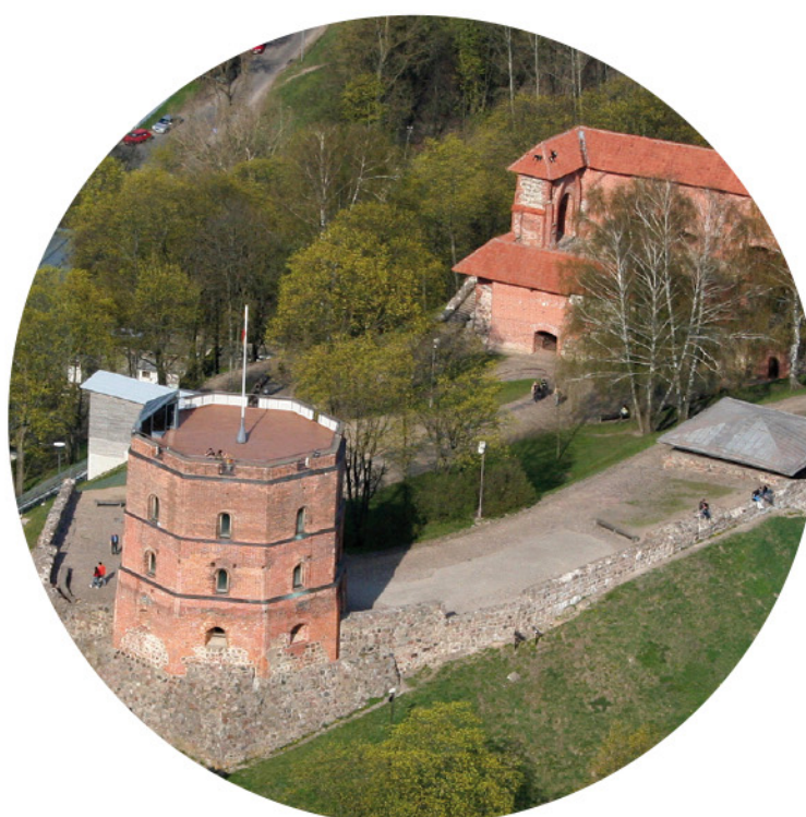
Vilnius First Mound (Gediminas Hill)