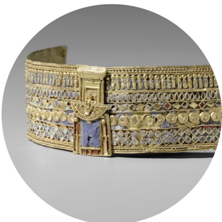
Upper arm bracelet with the ram-headed god Amun in a shrine, Ägyptisches Museum und Papyrussammlung, CC BY-NC-SA

Addition of new high quality content for archaeology to Europeana - images, texts, 3D models - ready for reuse.